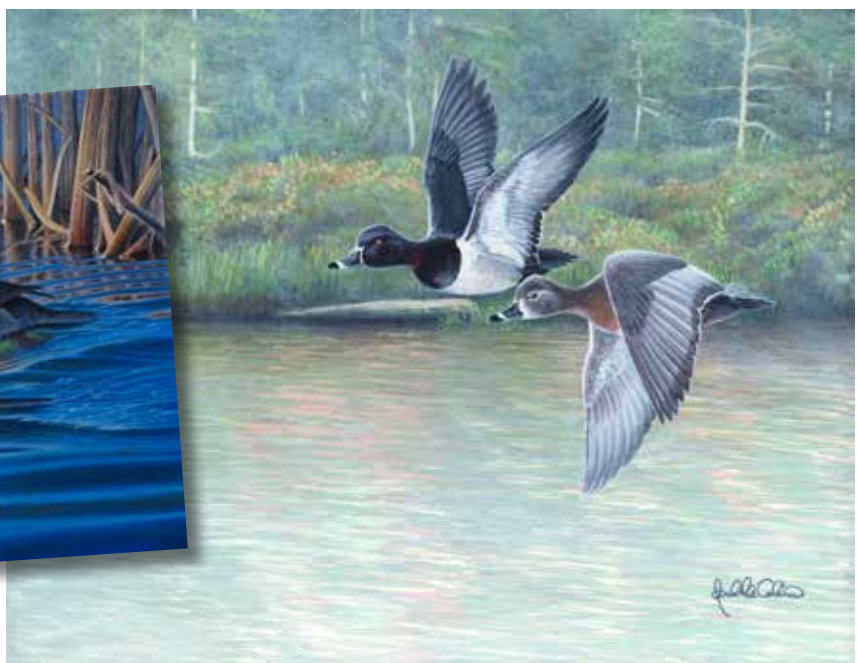
Photos: Canadian Wildlife Habitat Conservation Stamp